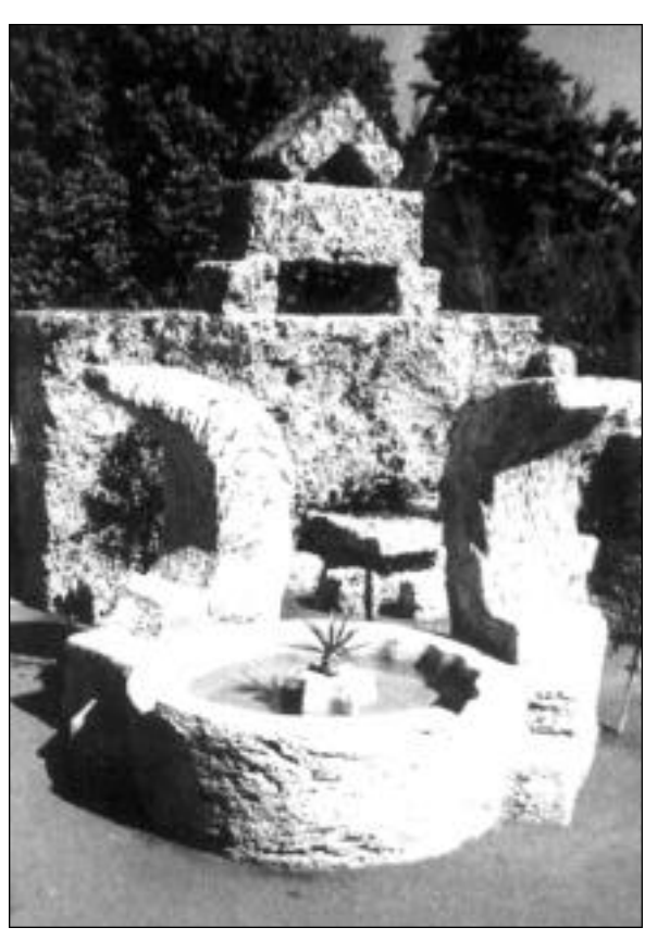
The Moon Fountain, carved from three pieces of coral.